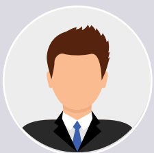
EDUCATORS OR END USERS