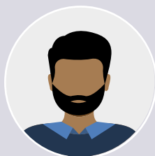
ATHLETIC DIRECTOR OR COACH