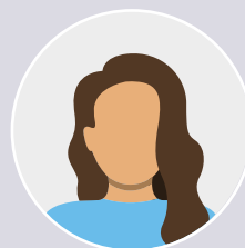
ACOUSTICAL & THEATRICAL CONSULTANTS